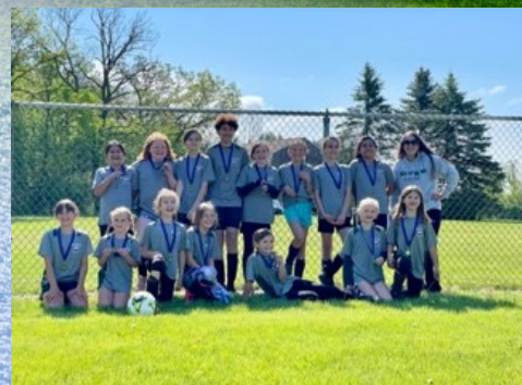
Spring 2023 Soccer