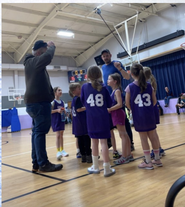
Winter 2023 Youth Basketball