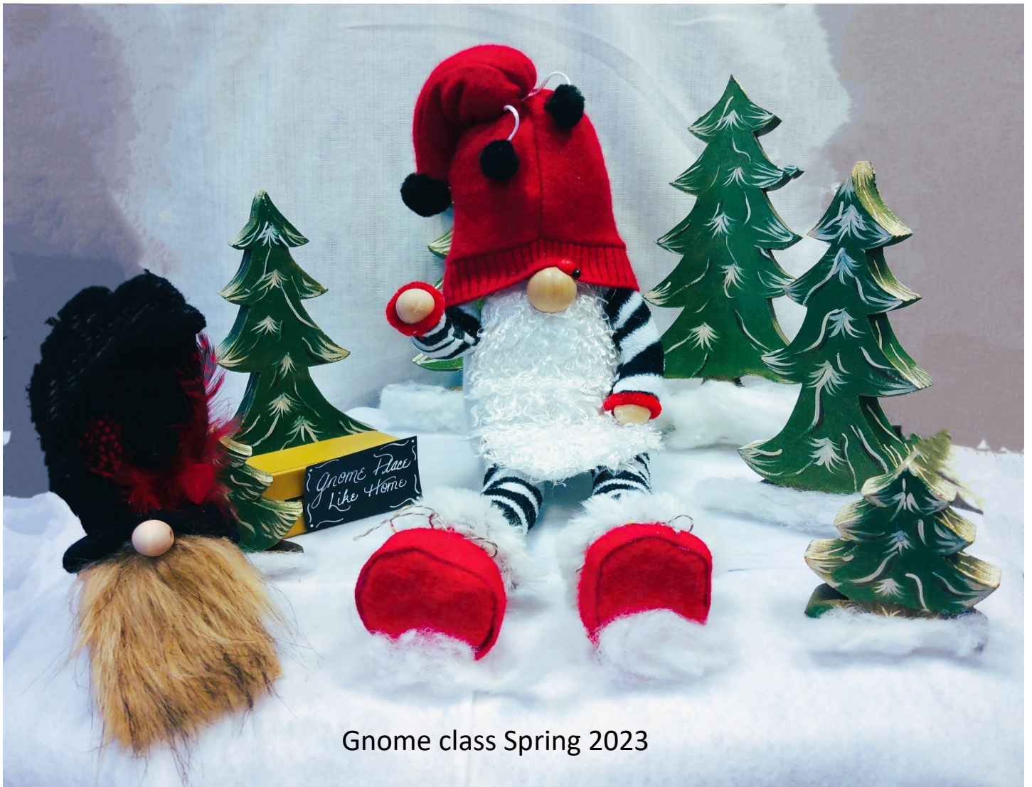
Gnome class Spring 2023