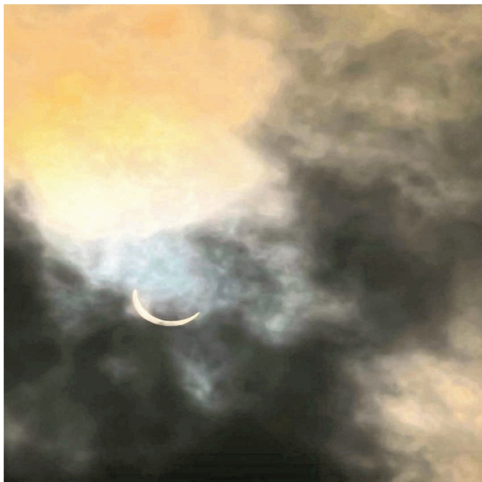
Photo taken during the Eclipse Mortons Cove, KY